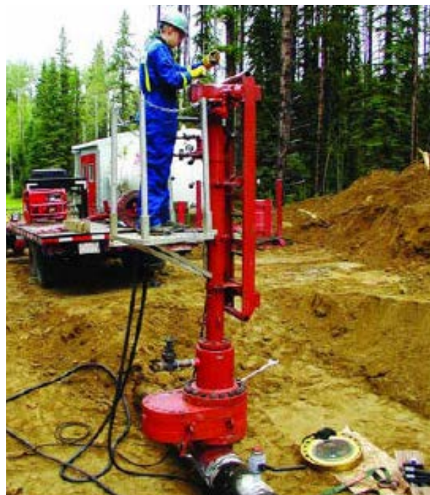
Figure 4: shows an example of a line stop being added to a pipeline 2

Even where pumpdowns and line stops cannot be used, mitigation measures such as flaring will reduce the effect vented gas has on the environment, as is discussed in the best-practice guide relating to flaring.