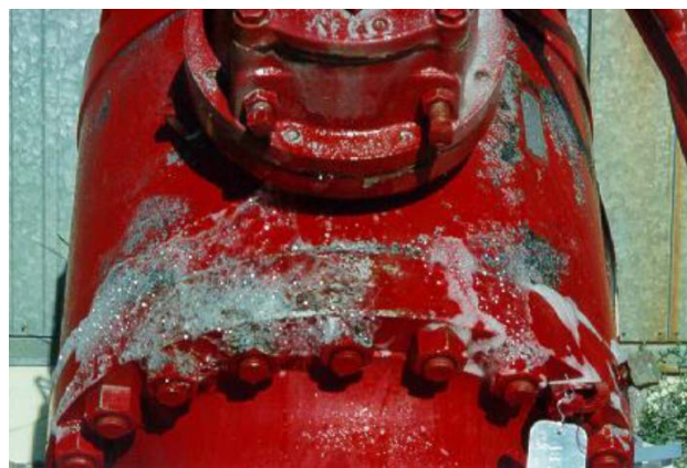
Figure 2 3 : shows a soaping check for leaks

Leak detection and repair is only an effective mitigation measure if repairs are successful in stopping the leak. This guide recommends that a repair is not considered to be successful until follow-up monitoring shows that the component is no longer leaking. Follow-up monitoring can use the same leak-detection method that discovered the leak, or it can use a method that is more sensitive than the original method. In many cases, soaping (spraying soapy water on the leak area and looking for bubbles which would indicate a leak) may be an acceptable way of checking whether the repair has been successful.