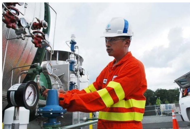
Figure 1 1 : Initial repairs being made

If the initial repair is not successful, a second attempt would need to be made, by a team that has different tools or expertise, as soon as reasonably practical.