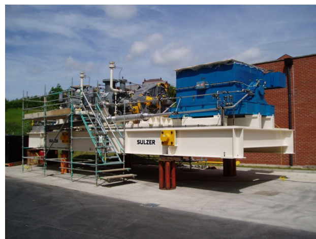
Figure 1: Natural gas compressor

US EPA Natural Gas Star partners 4 have reported that electric compressors also have lower maintenance costs than gas-powered compressors, making this mitigation strategy particularly cost-effective for remote locations with electrical power and high maintenance costs.