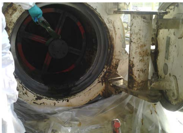
Figures 2a and 2b: Pigging Operations